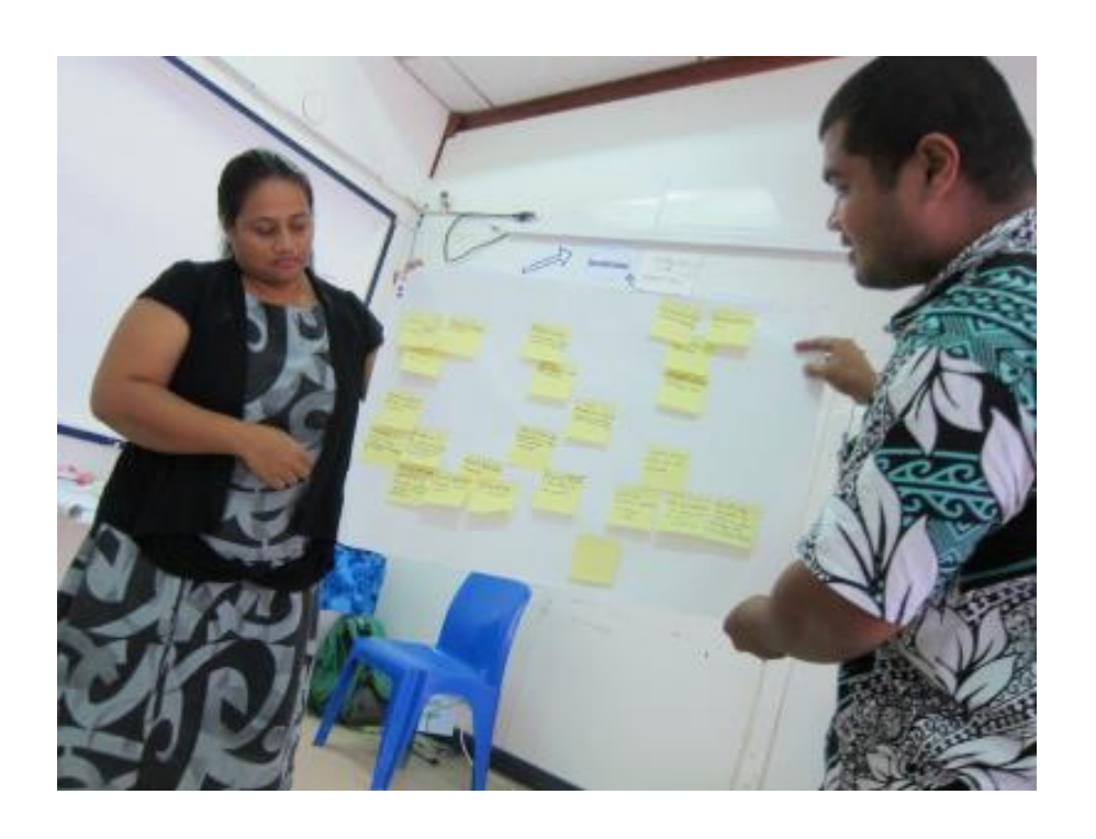
Annex 3 Photos of workshop activities